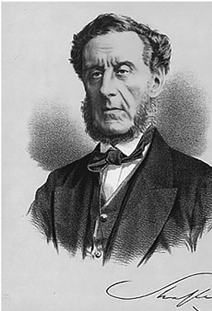
Portrait of Lord Shaftesbury painted by Anthony Ashley Cooper.

The godless, non-Bible system is at hand; and the Ragged Schools, with all their divine polity, with all their burning and fruitful love for the poor, with all their prayers and harvests for the temporal and eternal welfare of the forsaken, heathenish, destitute, sorrowful, and yet innocent children, must perish under this all-conquering march of intellectual power. Our nature is nothing, the heart is nothing, in the estimation of these zealots of secular knowledge. Everything for the flesh, and nothing for the soul; everything for time, and nothing for eternity. 22