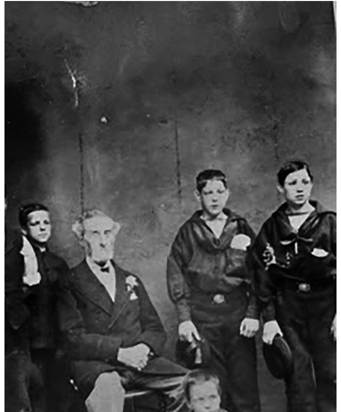
Lord Shaftesbury and a group of Manchester boys - 1883

The first piece of legislation to emerge, the Factory Act of 1833, was a compromise. Various aspects of the Act were not operative until 1836. In the intervening time, the government fell from office and the new prime minister, Lord Melbourne, attempted to ease some of the restrictions. Ashley was furious. He poured scorn on the government's claims and pressed the charge of hypocrisy. It was a powerful performance by Ashley, still only thirty-five years old. The government survived the ordeal by just two votes and then gracefully withdrew its proposals. Ashley's guerrilla tactics continued. In 1840 Ashley secured a commission into the operation of the earlier legislation. Ashley was appointed chairman, and this comprehensive report is a testament to his untiring commitment. In this same period, he was already actively involved in campaigning for the protection of the "climbing boys" (we will consider this in the second article) and the employment of children in mines. This latter form of exploitation was particularly harrowing. Children as young as five years old were employed in mines to push the trucks along roadways often only twenty-four inches high and attached to chains, to ventilate the mine shaft, and in various other